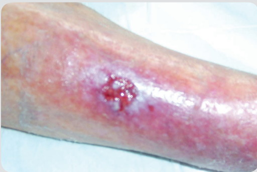
27th April 2010