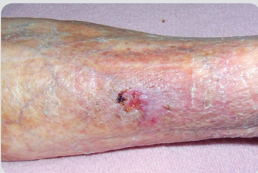
3rd May 2010