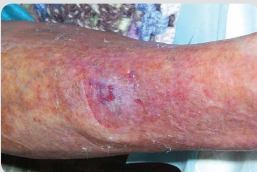
Wound healed – 17th May 2010