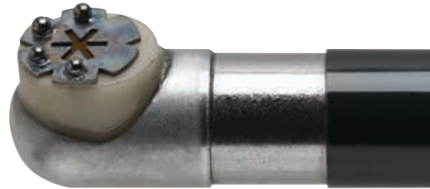
STARVAC 90 COBLATION Wand tip