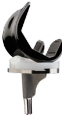
LEGION PRIMARY CR