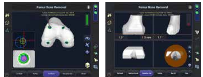
Robotics-assisted preparation and cut confirmation