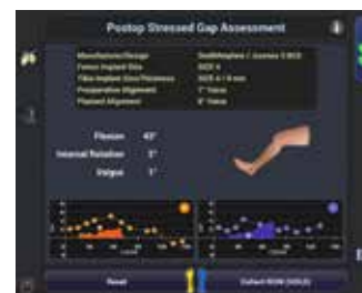
Postoperative long leg alignment and gap assessment

To learn more about NAVIO robotics-assisted orthopaedic surgery or to set up a demonstration, visit www.ReshapingMobility.com