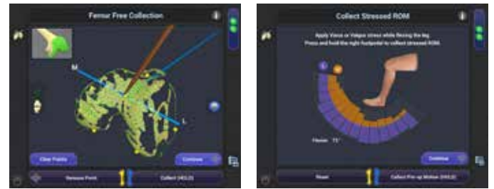
CT-free registration and joint laxity collection