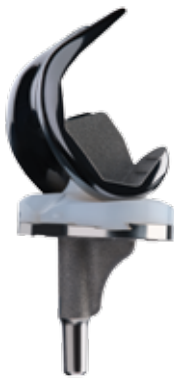
JOURNEY II BCS