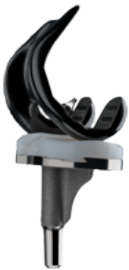
JOURNEY II CR