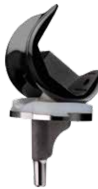
LEGION PRIMARY PS