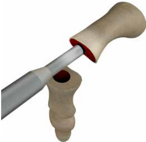
Figure 10: Tap until the laser mark is no longer visible