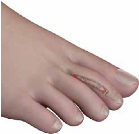
Figure 18. Completed repair