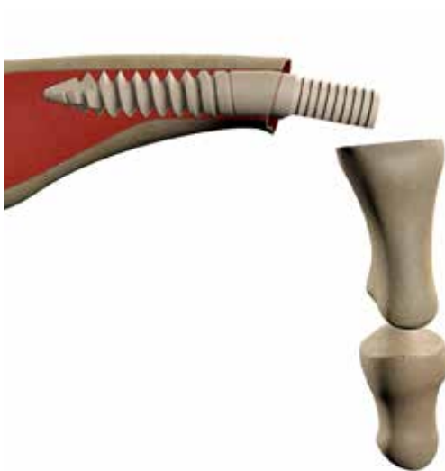
Figure 16: Insert the implant until the barbs on the implant should reach the osteotomy site.