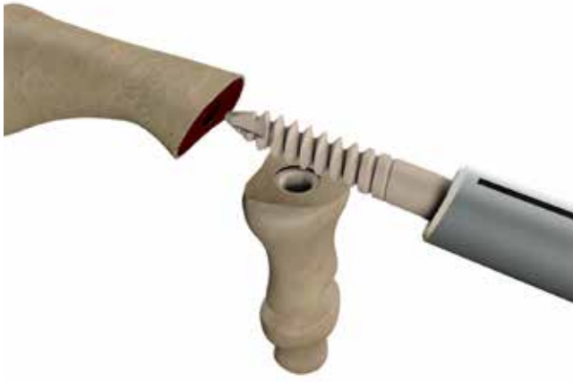
Figure 14: Attach the proximal phalanx implant to the driver