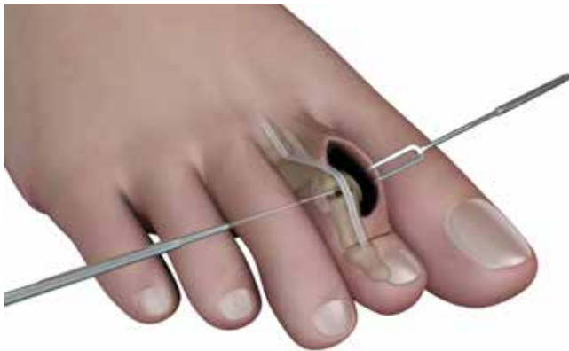
Figure 1: Incision