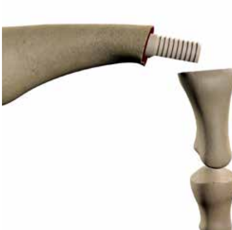
Figure 15: Insert the proximal phalanx implant

Note: For a 10° implant, utilize the laser mark on the 10° driver shaft to achieve the desired orientation