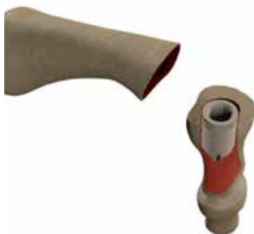
Figure 13: Implant inserted flush with or slightly countersunk in the bone