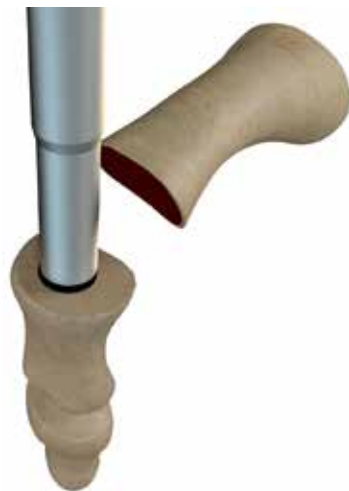
Figure 8: Tap until the laser mark is no longer visible