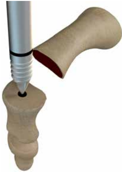
Figure 7: Tap the middle phalanx