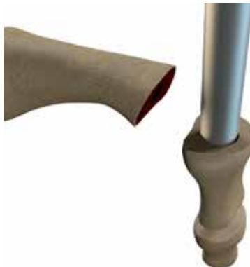
Figure 12: Insert the middle phalanx implant