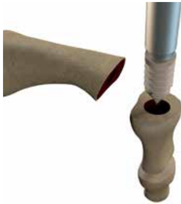
Figure 11: Assemble the middle phalanx implant to the driver