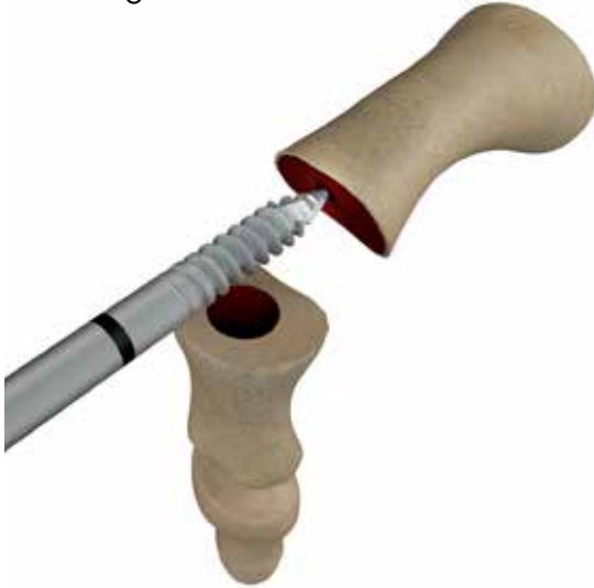
Figure 9: Tap the proximal phalanx